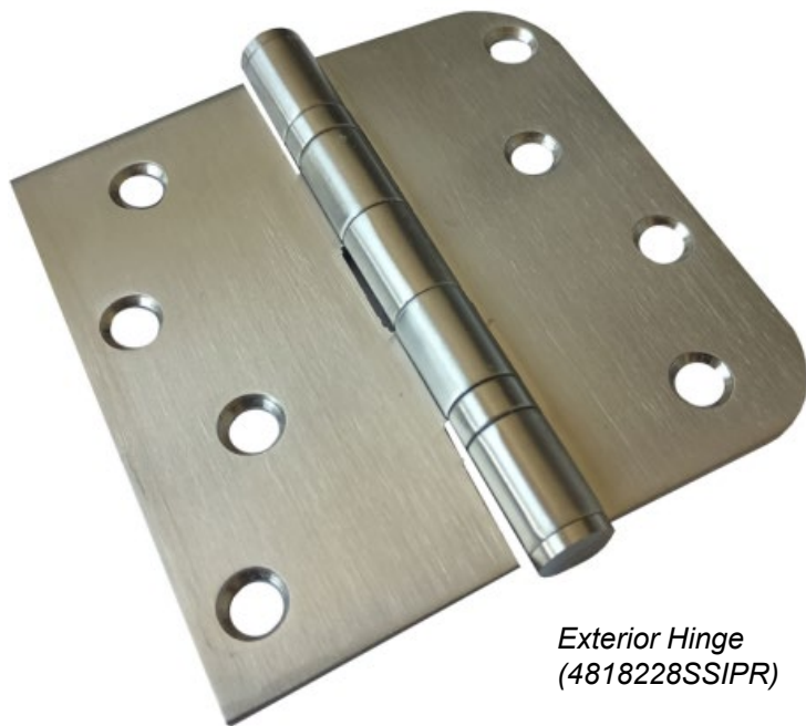
Exterior Hinge (4818228SSIPR)