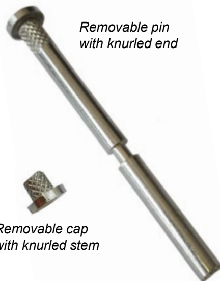
Removable pin with knurled end